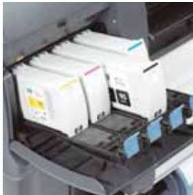
HP large black ink cartridge

* Compared to any HP Designjet 600/700/800/1000 Printer series