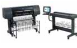
HP Designjet 4500mfp