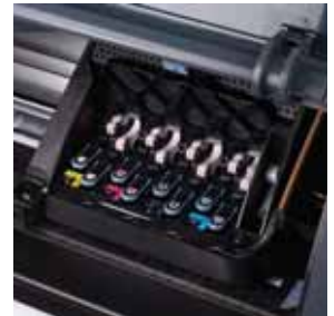
HP Double Swath Technology