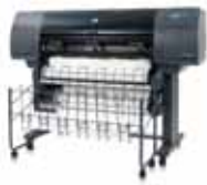
HP Designjet 4500/4500ps printer