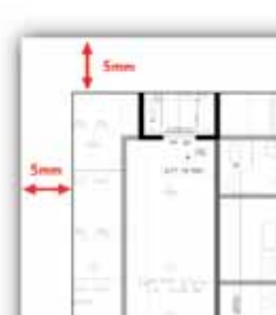
5 mm margins