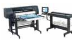
HP Designjet 4500mfp + optional stacker