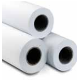
HP long media roll