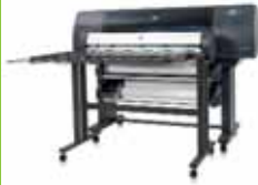
HP Designjet 4500/4500ps printer + optional stacker